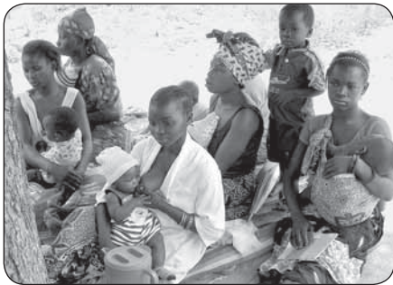
M Materu/ COUNSENUITH

There is widespread confusion about the impact of stress on milk production. Many believe that stress or trauma will cause a woman's milk to "dry up." In reality, stress does not end the milk production process, though it can inhibit milk flow due to delayed milk ejection reflex. Breastfeeding actually helps reduce tension and stress, calm the baby, and create a loving bond that helps milk to flow well. Skin-to-skin contact with their infants has also been found to minimize stress cortisol levels in women (Feldman 2006) which can, in turn, help women relax and allow milk to flow. This reduction in tension and stress on the part of the mother helps her cope with the difficult situations ahead.