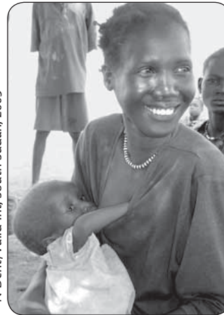
N Dent/Valid Int, South Sudan, 2003