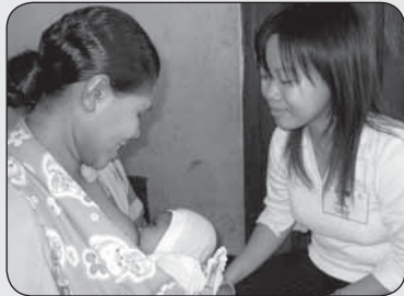
W Timor, Feb-Mar 2006

As a result of the program, 65% of the women followed by the peer helper continued to breastfeed exclusively. This is in sharp contrast to the high numbers of mothers (up to 80%) who switched to formula in other parts of Indonesia as a result of infant formula contributions.